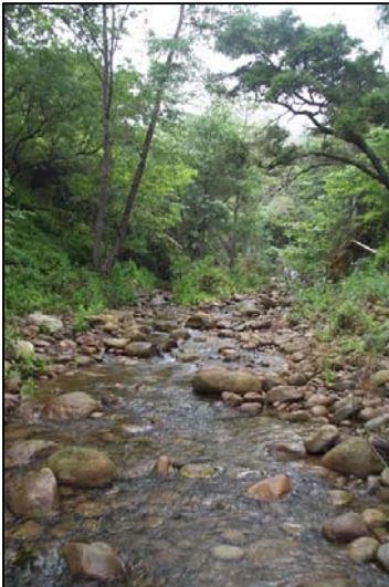
Riffle in Gobernador Creek (C-3)

These photographs show examples of relatively pristine study streams. Intact riffle and pool habitats and clean water in these streams support highly diverse aquatic communities, including a variety of disturbance-sensitive BMIs (e.g., stoneflies, mayflies, caddisflies, and dragonflies) and vertebrates including steelhead trout, southwestern pond turtle, California newt, and two-stripe garter snake.