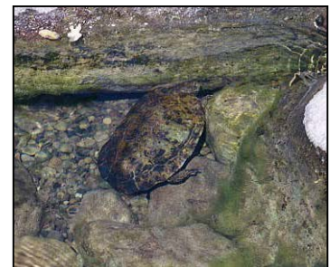
Southwestern pond turtle observed in El Capitan Creek