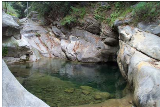
Deep pool in San Jose Creek (SJ-3)