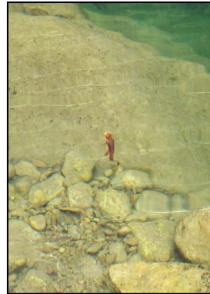
California newt observed in San Jose Creek (SJ-3)