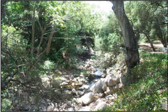
Upper Mission Creek (M-3)