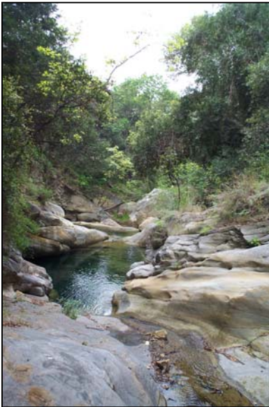
Upper San Jose Creek (SJ-3)

Collectively, the undisturbed study reaches range from small, high-gradient 1 st -order mountain tributaries to fairly large, low-gradient 5 th order streams. The photographs above and to the left show examples of high-gradient mountain streams. The photographs on the bottom show examples of larger, low-gradient streams.