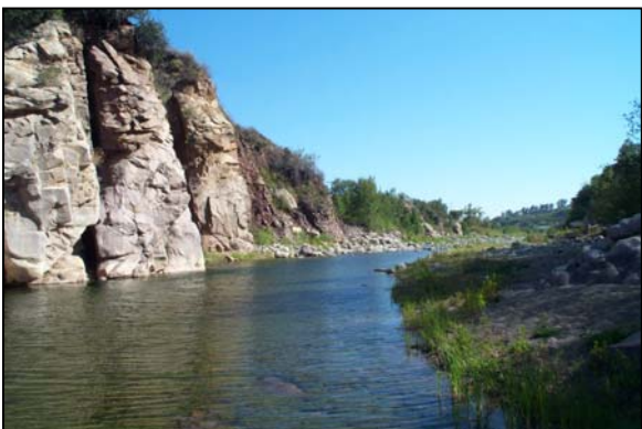
Lower Sespe Creek (SES-1)

Collectively, the undisturbed study reaches range from small, high-gradient 1 st -order mountain tributaries to fairly large, low-gradient 5 th order streams. The photographs above and to the left show examples of high-gradient mountain streams. The photographs on the bottom show examples of larger, low-gradient streams.