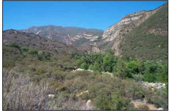
Upper Matilija Creek (MA-2)