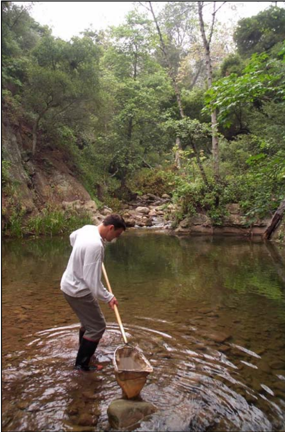
Figure 7: Study Reach Photographs