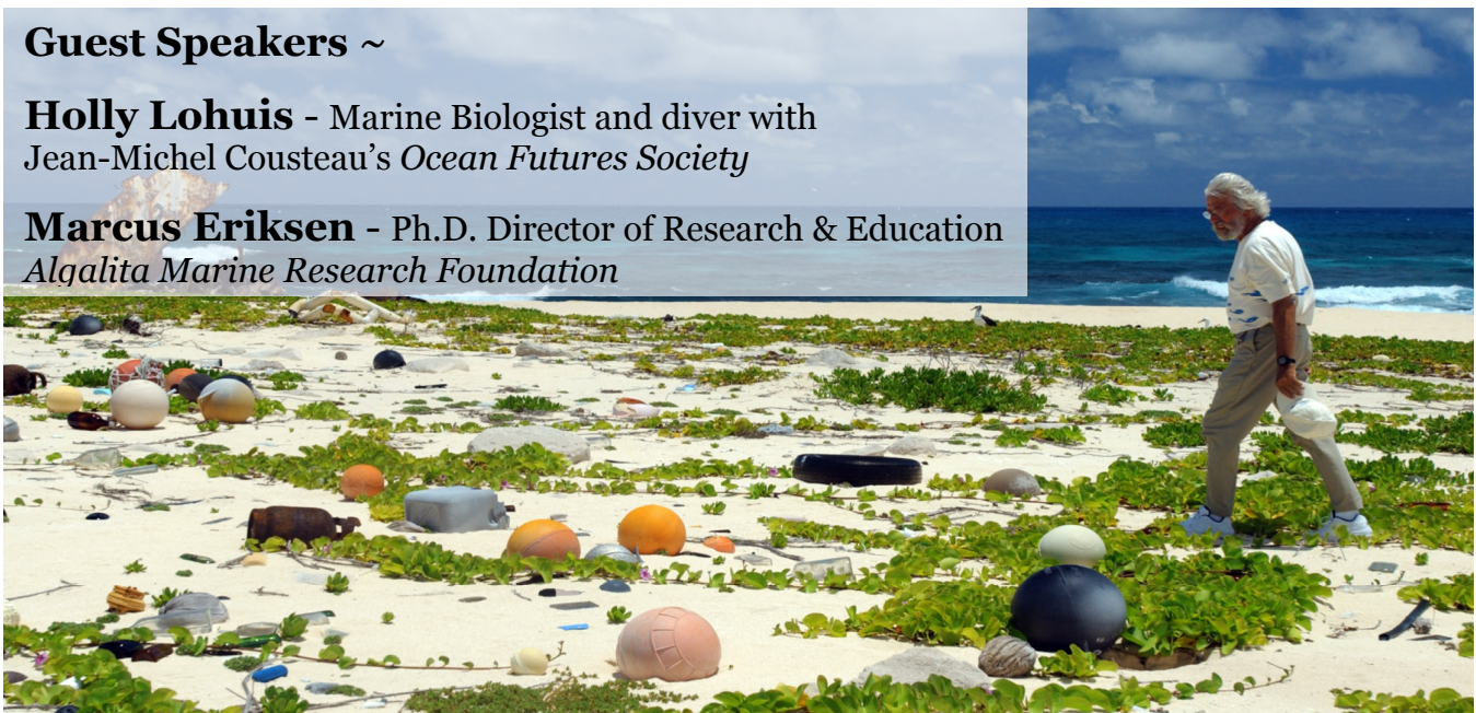
Photo of Jean-Michel Cousteau on Laysan Island