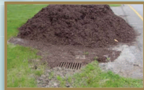
Any obstruction to a storm drain