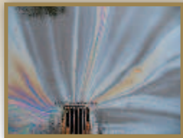
Gas and oil entering a storm drain