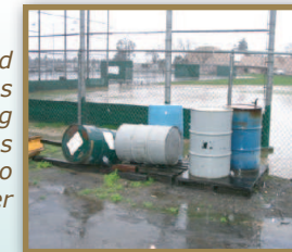
Abandoned 55-gallon drums containing unknown wastes exposed to rainwater