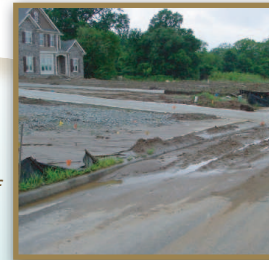
Illicit discharge of sediment to storm drain system