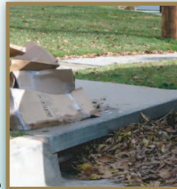
Yard waste obstructing a storm drain