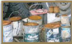
Abandoned cans of paint